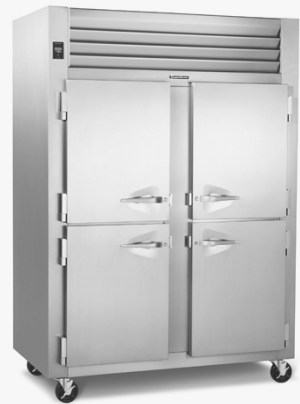
Model RHT232WUT-HHS (shown with optional casters)