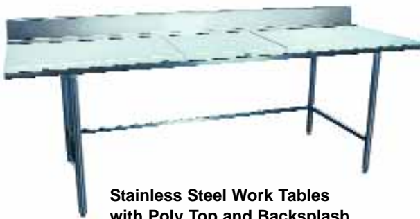
Stainless Steel Work Tables with Poly Top and Backsplash