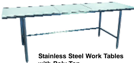
Stainless Steel Work Tables with Poly Top

WIN-HOLT boning and trimming tables are designed for Food Service, Healthcare, Supermarket and Backroom applications.