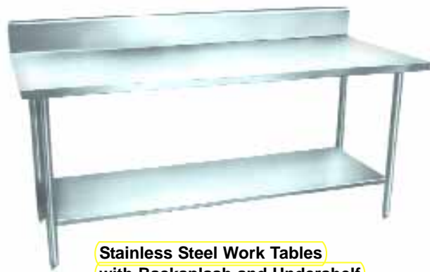
Stainless Steel Work Tables with Backsplash and Undershef