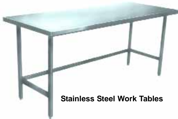
Stainless Steel Work Tables

WIN-HOLT offers a full line of Stainless Steel products. If you do not see it listed in our Catalog, ask your WIN-HOLT representative for assistance. We would appreciate the opportunity to quote you.