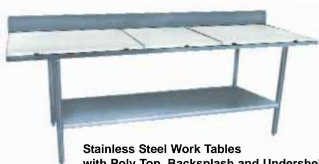
Stainless Steel Work Tables with Poly Top, Backsplash and Undershelf