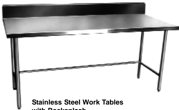
Stainless Steel Work Tables with Backsplash

/M Mobile Table Add $162 Mobile units use Caster Model #800