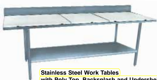
Stainless Steel Work Tables with Poly Top, Backsplash and Undershelf