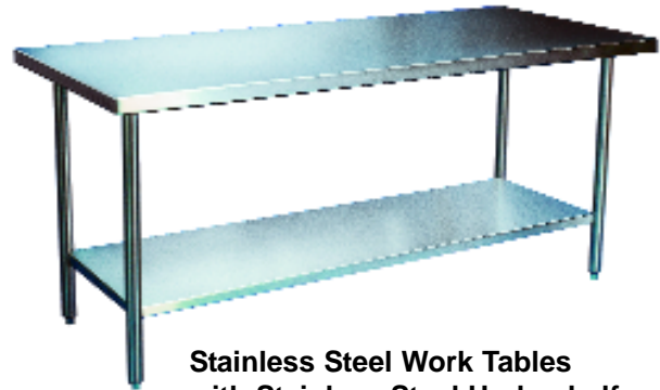
Stainless Steel Work Tables with Stainless Steel Underself