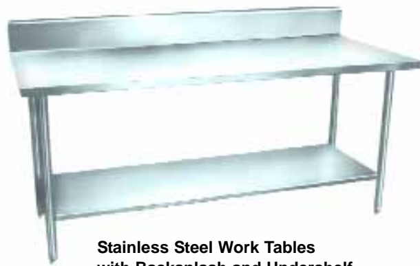
Stainless Steel Work Tables with Backsplash and Undershef